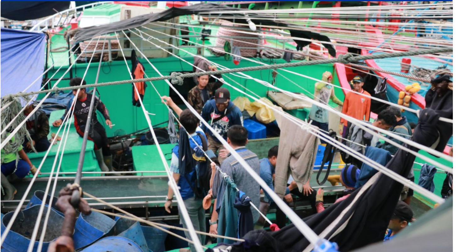
TRAFFICKING IN PERSONS IDENTIFICATION TRAINING IN THE FISHING INDUSTRY